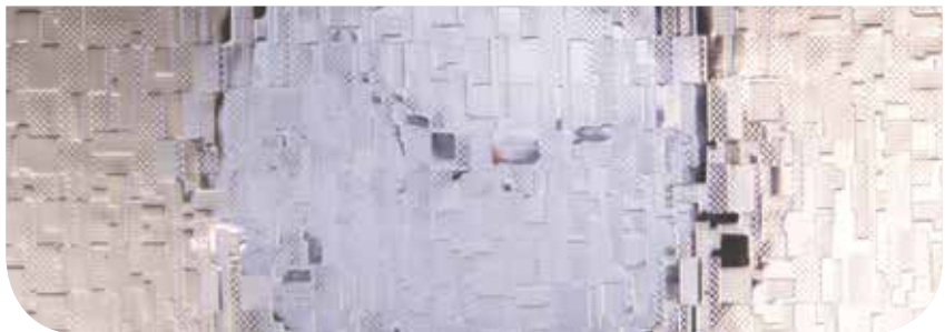
Digital™ Privacy Level 3