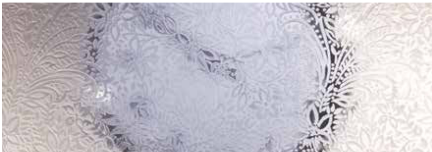
Chantilly™ Privacy Level 2