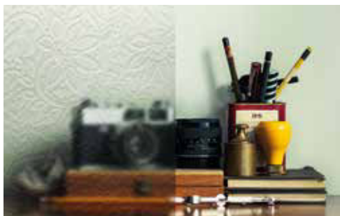
Privacy Level 2