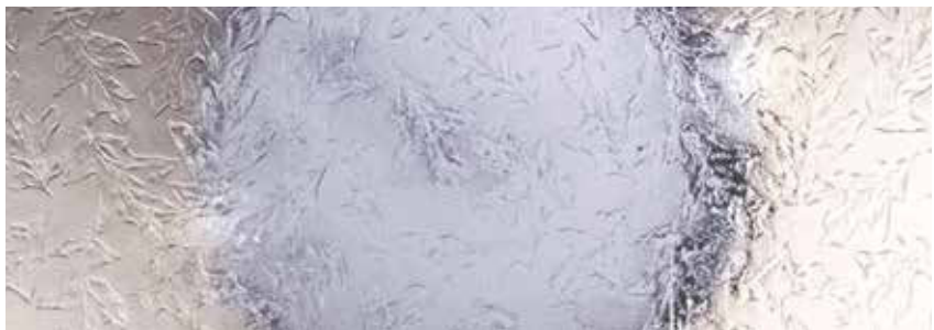
Oak™ Privacy Level 4