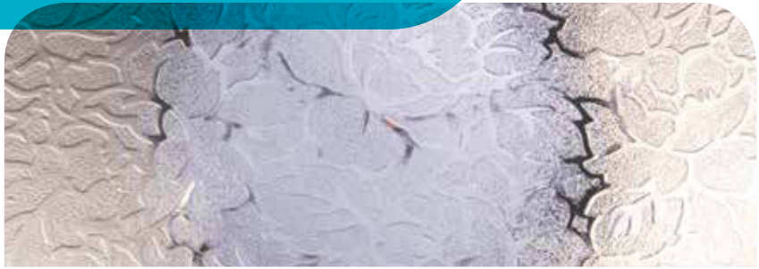
Florielle™ Privacy Level 4