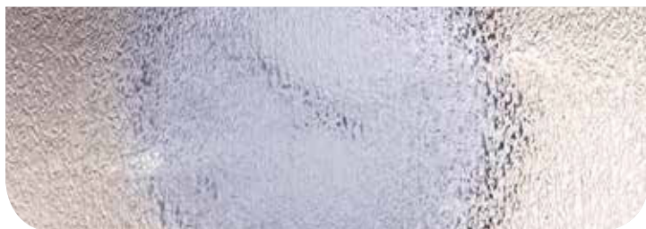
Contora™ Privacy Level 4