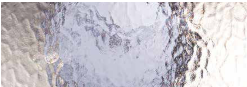
Minster™ Privacy Level 2