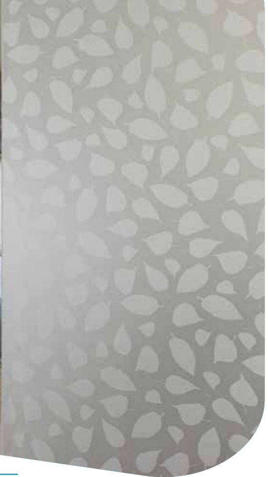
Bay™ Opal Privacy Level 5