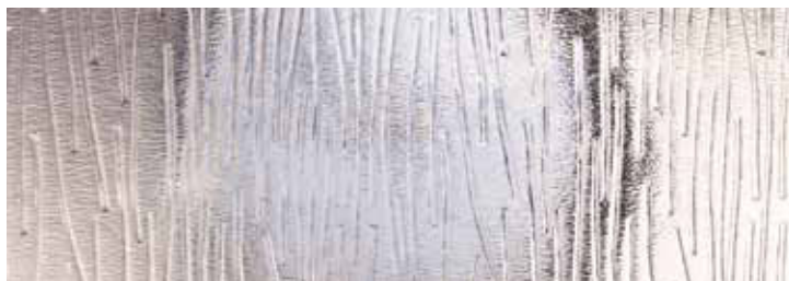
Charcoal Sticks™ Privacy Level 4