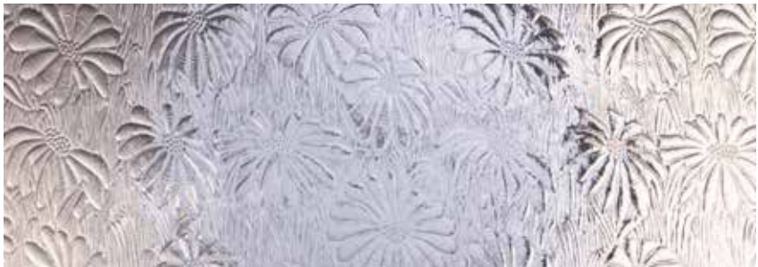
Mayflower™ Privacy Level 4