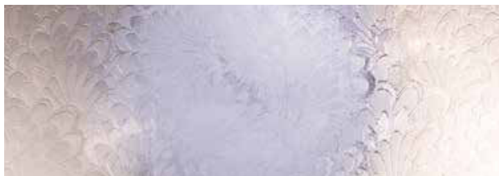
Pelerine™ Privacy Level 5