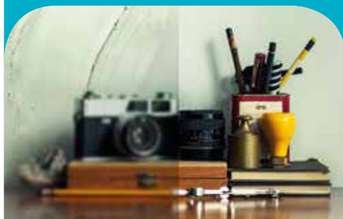
Privacy Level 1