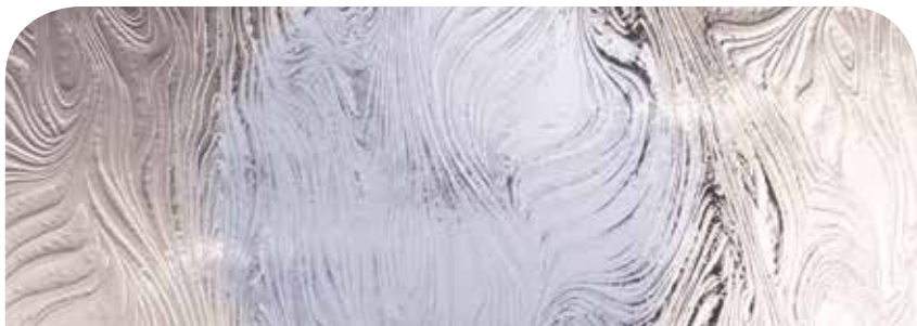
Taffeta™ Privacy Level 3