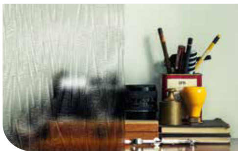
Privacy Level 4