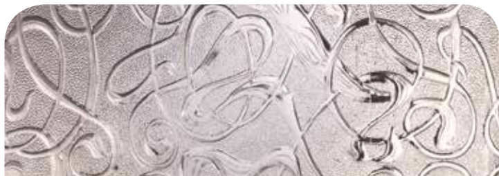
Everglade™ Privacy Level 5

Choose from a wide range of great Pilkington designs.