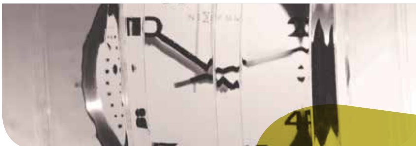
Warwick™ Privacy Level 1

To discover more about the use of Warwick™ please visit our website